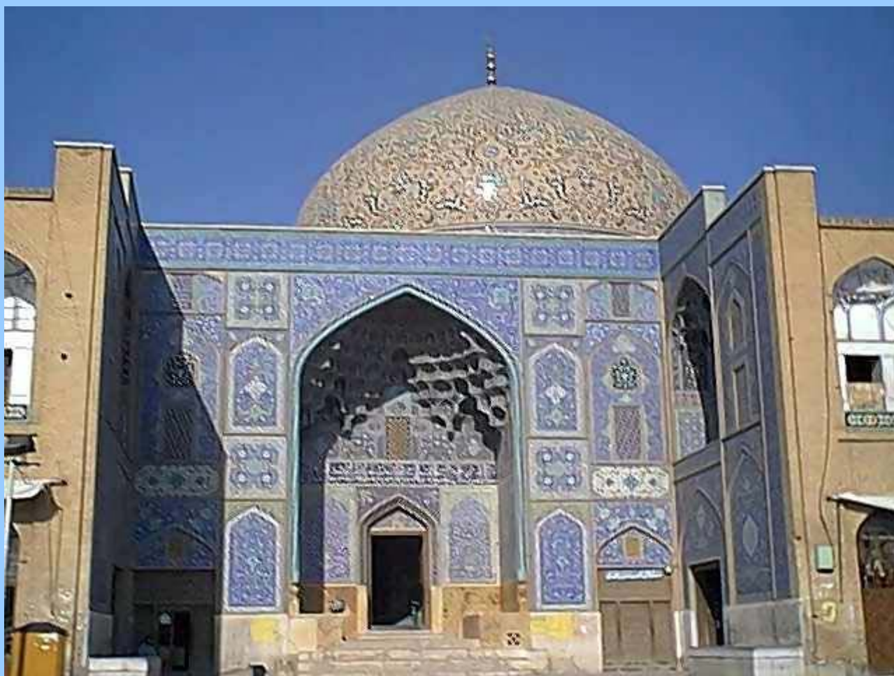
Sheikh Lotf'u'llah Mosque in Isfahan- Persia