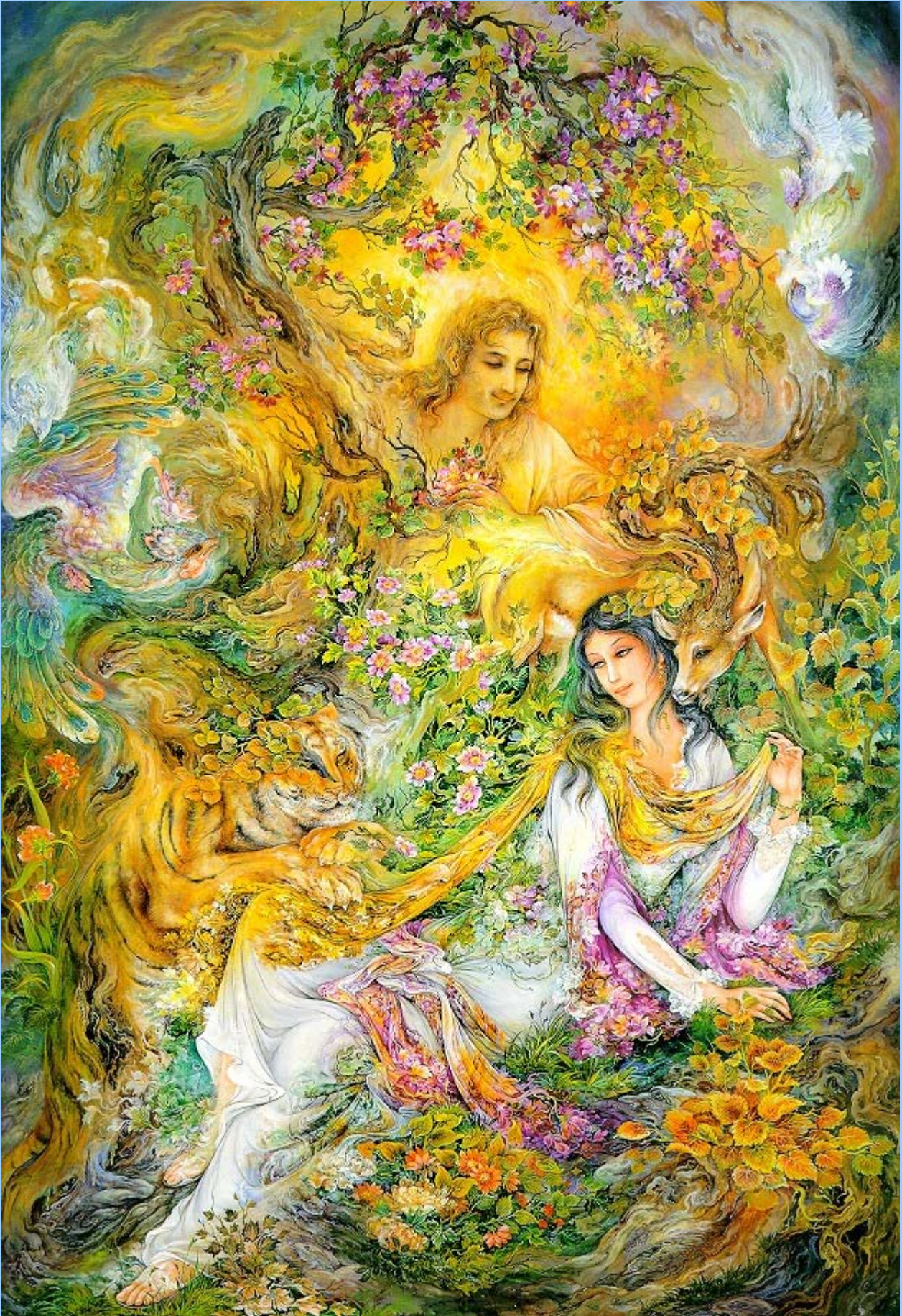
ANOTHER CLASSICAL PERSIAN MINIATURE PAINTING