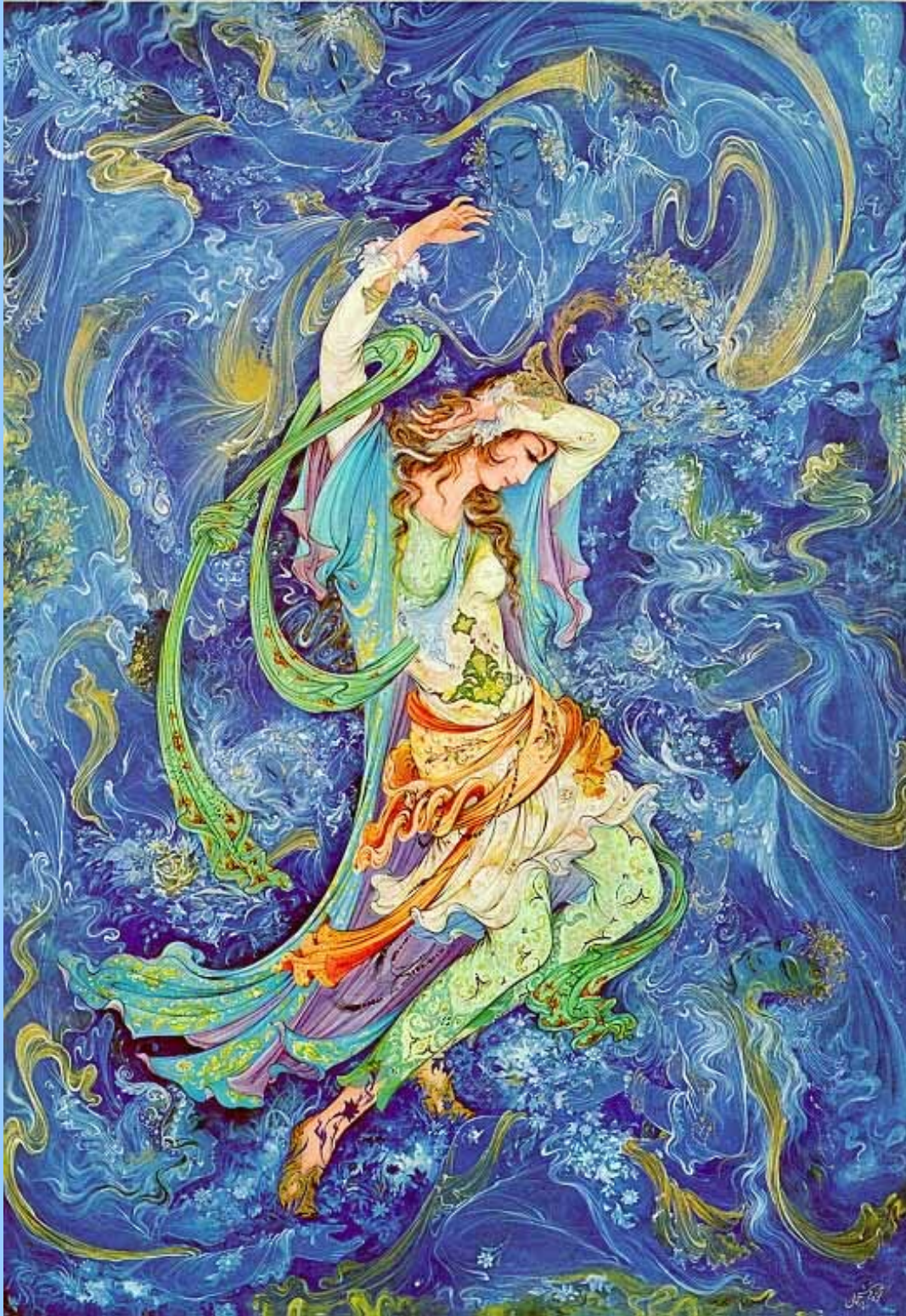
A PERSIAN CLASSICAL MINIATURE PAINTING