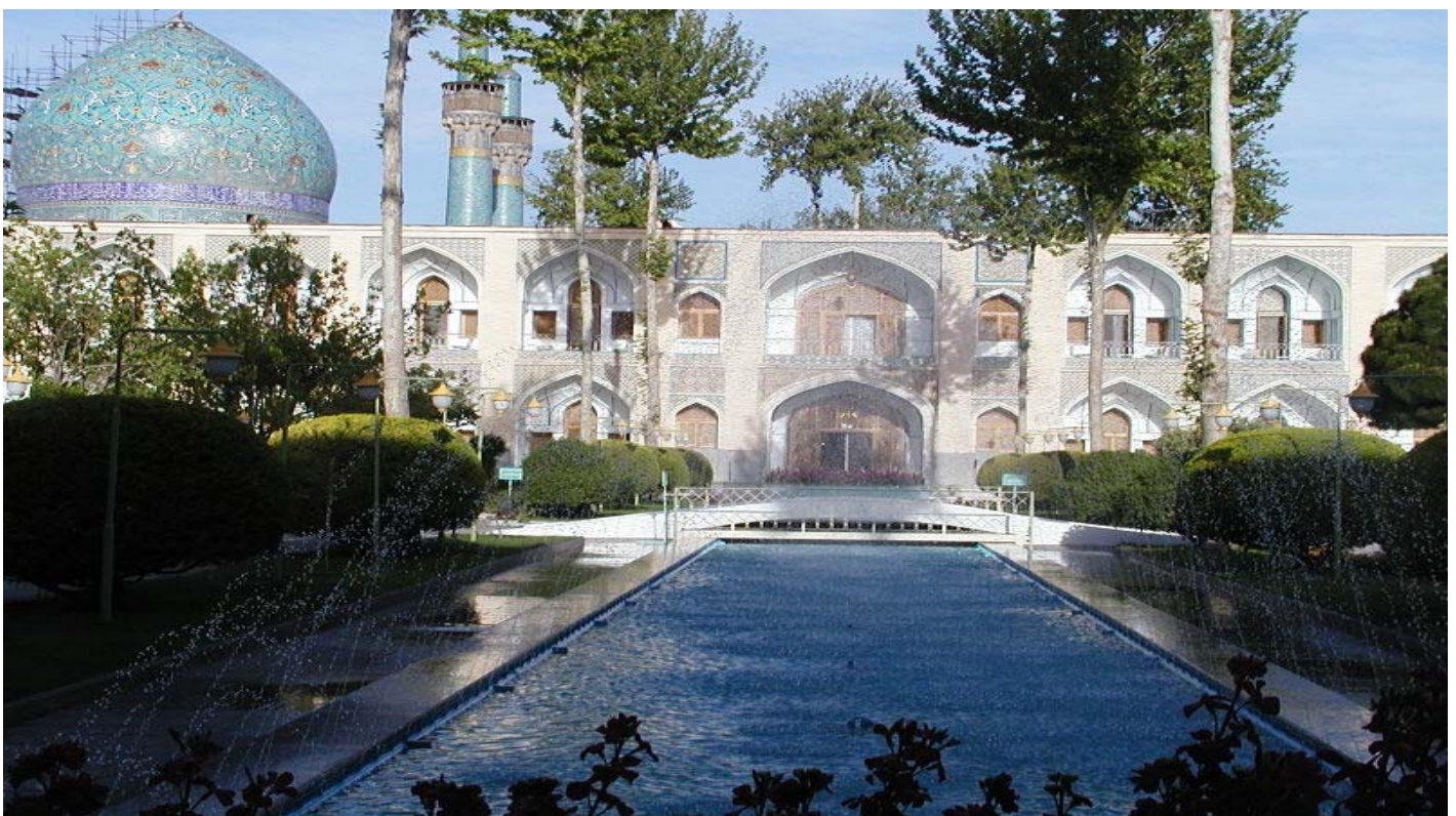
Shah Abbas Hotel - Isfahan, Iran