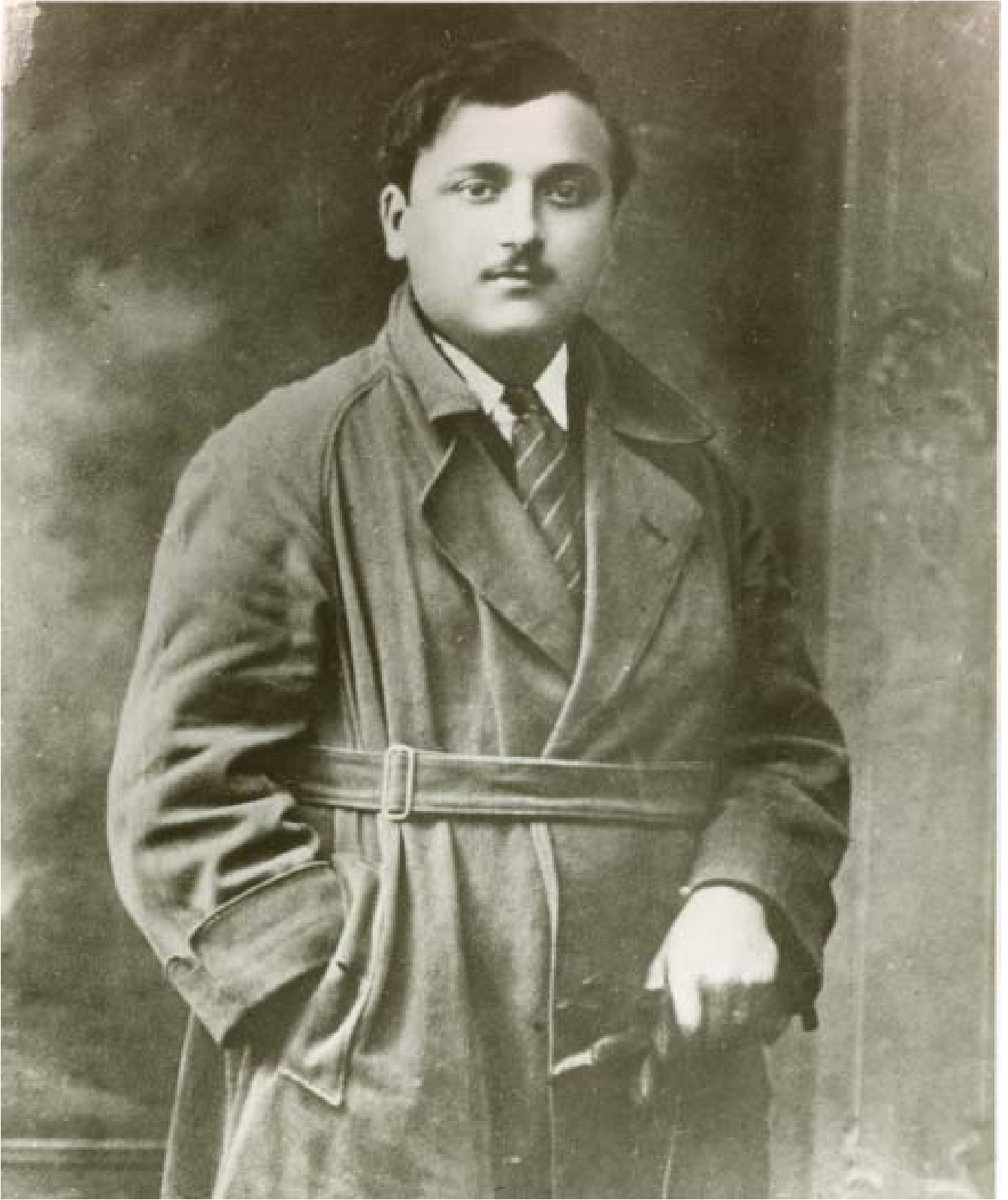
SHOGHI EFFENDI RABBANI The 1 st Guardian of the Baha'i March 3 rd , 1896-November 4 th , 1957

شماره ٦ شهر المسائل ١٦٤ بديع دسامبر ٢٠٠٧ ميلادى